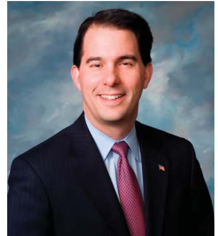
SCOTT WALKER, GOVERNOR STATE OF WISCONSIN

“NOW IS THE TIME FOR BOLD IDEAS AND COOPERATION TO MOVE WISCONSIN'S ECONOMY FORWARD. WEDC HAS THAT CLEAR FOCUS OF SPURRING BUSINESS GROWTH THROUGHOUT THE STATE. WISCONSIN IS NOT ONLY OPEN FOR BUSINESS — WISCONSIN IS GOOD FOR BUSINESS.”