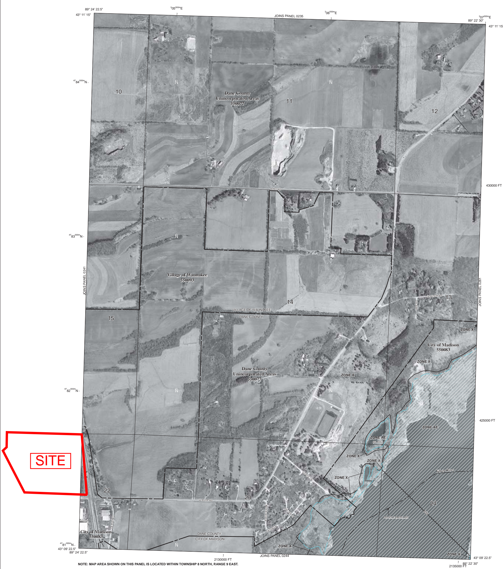
NOTE: MAP AREA SHOWN ON THIS PANEL IS LOCATED WITHIN TOWNSHIP 8 NORTH, RANGE 9 EAST.

If you have questions about this map or questions concerning the National Flood Insurance Program in general, please call 1-877-FEMA-MAP (1-877-336-2627) or visit the FEMA website at http://www.fema.gov .